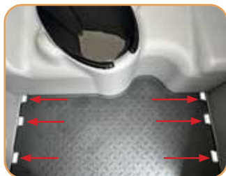
Integrated floor drainage system for easy cleaning