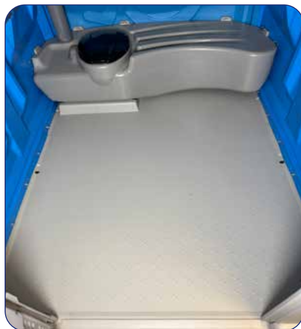
Patented floor design