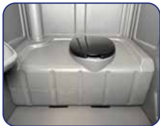
Sloped tank with drainholes for easy cleaning