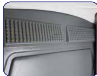
Molded-in vent screens