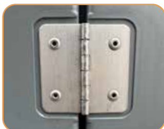
3-heavy duty stainless steel hinges