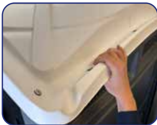
Corner drain roof w/hand grip for easy tilt and moving