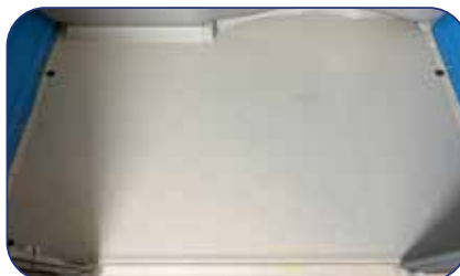
Patented floor design