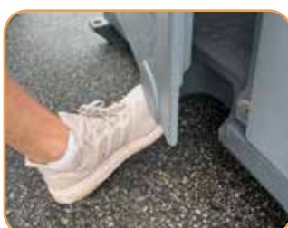
Hands free, no-touch door opening