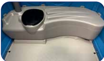
Available in 45 or 70 Gallon Tanks

New! Handrail design for easy grip and quicker build time. (45 Gallon Tank Shown)