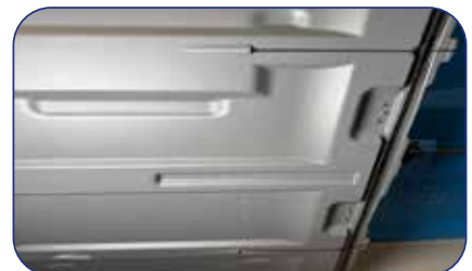
2-strain relief door springs