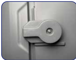
Heavy-duty rotary latch