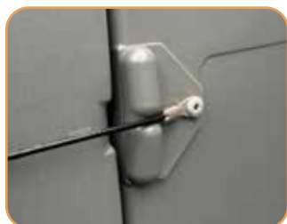
2-strain relief door springs