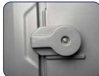
Heavy-duty rotary latch