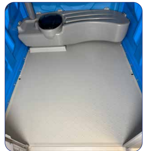
Patented floor design