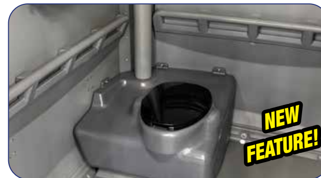
New! Handrail design for easy grip and quicker build time. (45 Gallon Tank Shown)