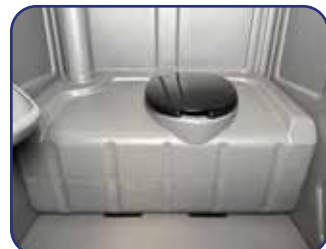
Sloped tank with drainholes for easy cleaning