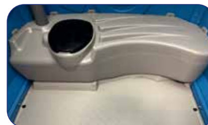
Available in 45 or 70 Gallon Tanks