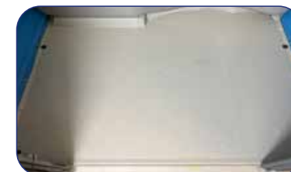
Patented floor design