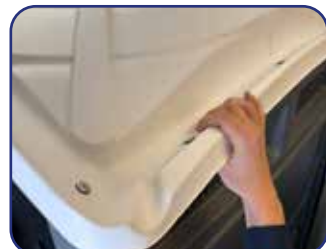
Corner drain roof w/hand grip for easy tilt and moving