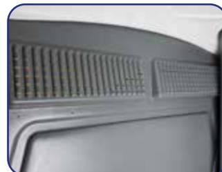
Molded-in vent screens