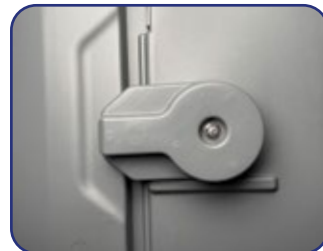
Heavy-duty rotary latch