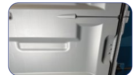
2-strain relief door springs