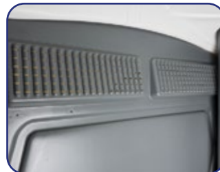
Molded-in vent screens