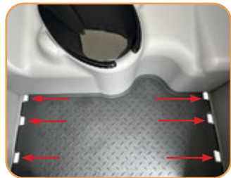
Integrated floor drainage system for easy cleaning