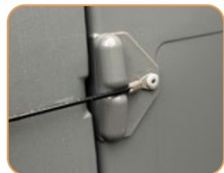
2-strain relief door springs