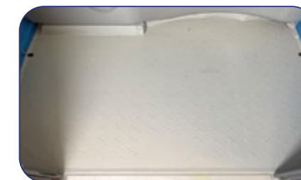
Patented floor design