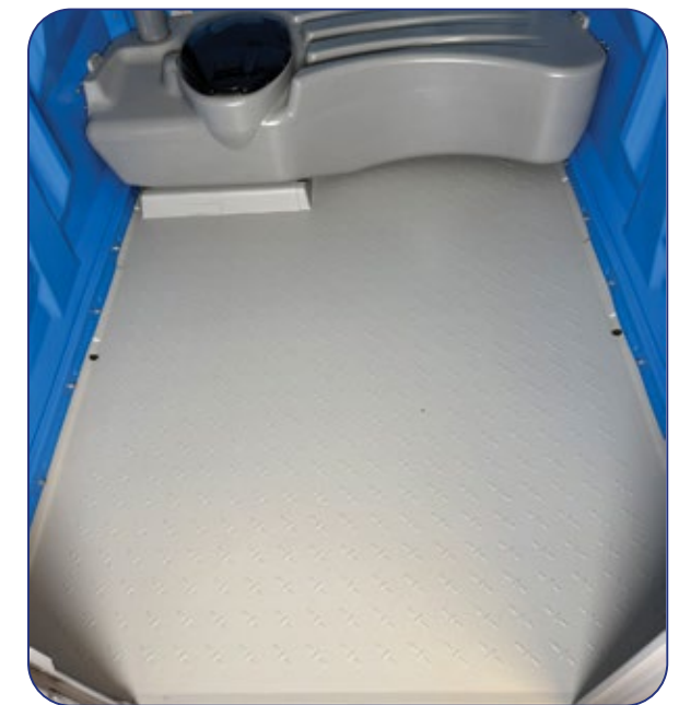
Patented floor design