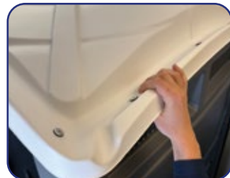
Corner drain roof w/hand grip for easy tilt and moving