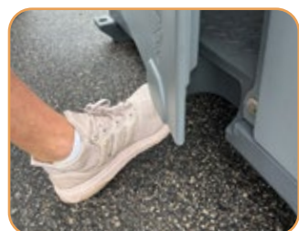
Hands free, no-touch door opening