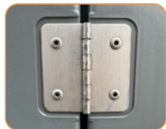
3-heavy duty stainless steel hinges