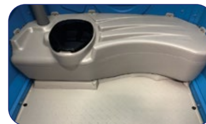
Available in 45 or 70 Gallon Tanks