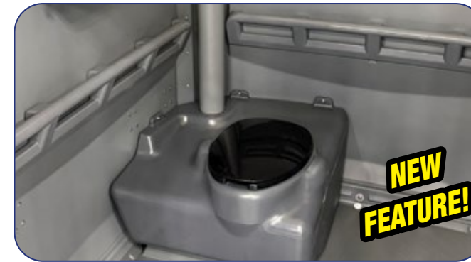
New! Handrail design for easy grip and quicker build time. (45 Gallon Tank Shown)