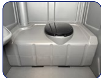
Sloped tank with drainholes for easy cleaning